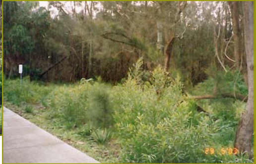
Same planted area near footpath in 2003