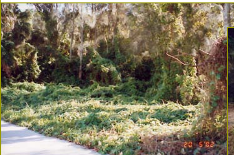
May 2002 view of site before clearing work was started.

Beverley Harvey commented, “so far we are very happy with the site as we have been keeping on top of the weeds and we feel we are winning the battle.”