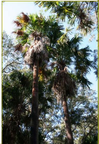
Left: Mature Cabbage Tree Palms tower over the site.