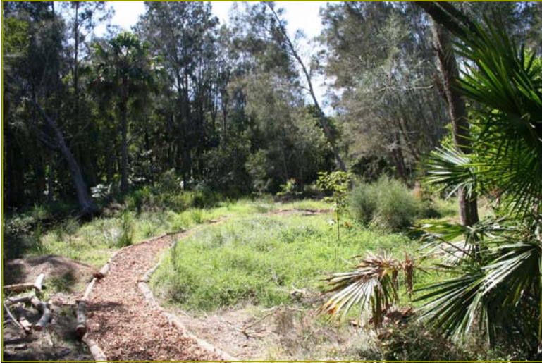
This area has been cleared of dense thickets of weed such as Lantana, Morning Glory & Madiera Vine.

Two Endangered Ecological Communities (EEC) are present on the Pelican-Blacksmiths site. An EEC is an ecological community listed as facing a very high risk of extinction in NSW under the Threatened Species Conservation Act 1995 . Swamp Oak Floodplain Forest , and Swamp Sclerophyll Forest on Coastal Floodplains are the two EEC's present, and there are remnants of a third - Littoral Rainforest .