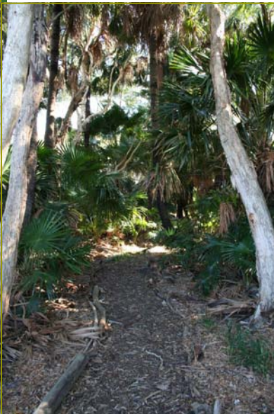
Right: One of the many paths the group have constructed on the site.

Lake Macquarie is a large, intermittently open, saline coastal lagoon in NSW. It covers an area of approximately 110 square kilometres, and has a catchment area of 605 square kilometres. The lake contains many estuarine creek zones where freshwater tributaries interface with the saline body of the main lake, and it supports a wide range of habitats. It is subjected to a wide range of uses, including recreation, industry, development, and rural activities, resulting in a high degree of modification to the natural environment of the region.