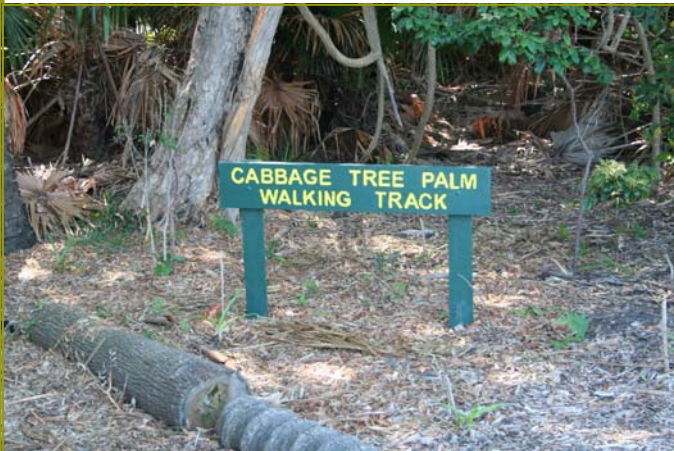
The sign erected at the start of the "Cabbage Tree Palm Walking Track."

It is anticipated that this project will see the riparian zone of an unnamed watercourse restored, improving the water entering Lake Macquarie. It will