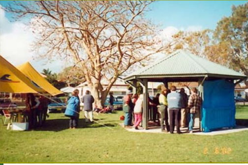
June 2002 the official launch of the work