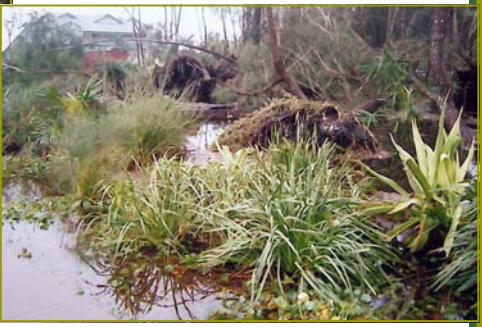
June 2007 storm, site flooded and trees uprooted!