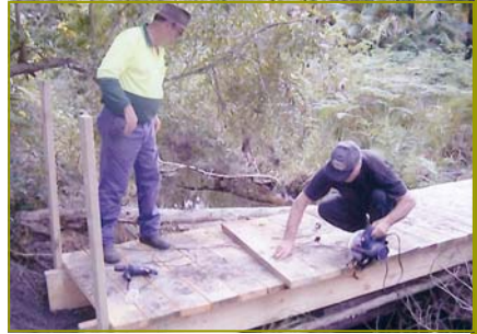
The first bridge is built

also improve biodiversity, natural habitat, connectivity, visual amenity, and provide social benefits to local residents and visitors to the site.