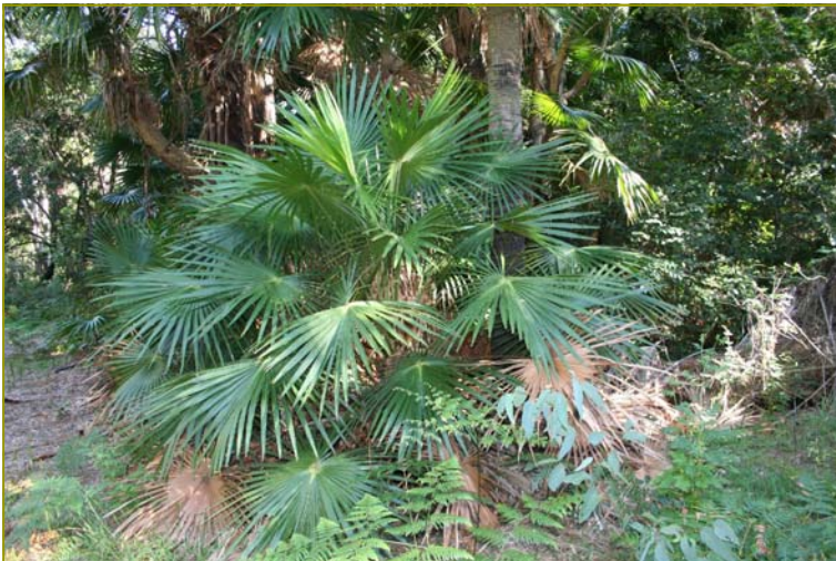
Cabbage Tree Palms - Livistona australis are a feature of the site