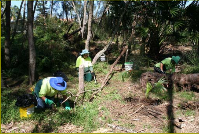
Members of the Landcare group work on the site every Monday, Wednesday, Thursday and Friday, from 9am to 2pm

The key threatening processes of the Pelican – Blacksmiths site are the presence of exotic vines and scramblers; the invasion of native plant communities by exotic perennial grasses, bitou bush and boneseed; and the presence of Lantana camara .