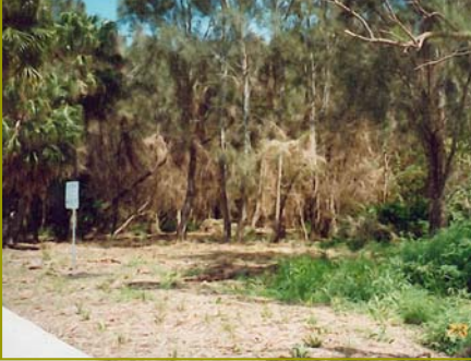
Planted area near footpath in 2002