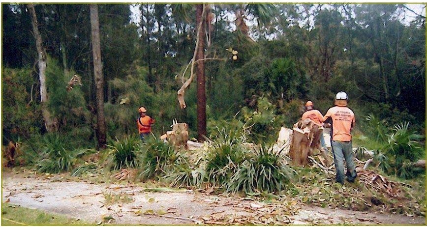
Going, going, gone! Coral Trees and Norfolk Island Hibiscus are removed