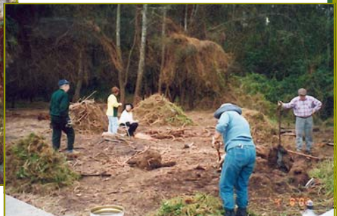
June 2002 clearing along the edge of the footpath