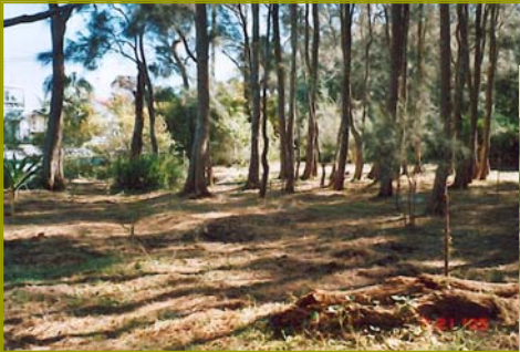
June 2005 cleared area at the Lake end of the site