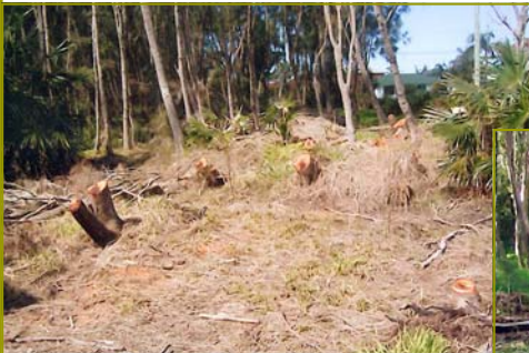
September 2007 storm damaged trees removed.